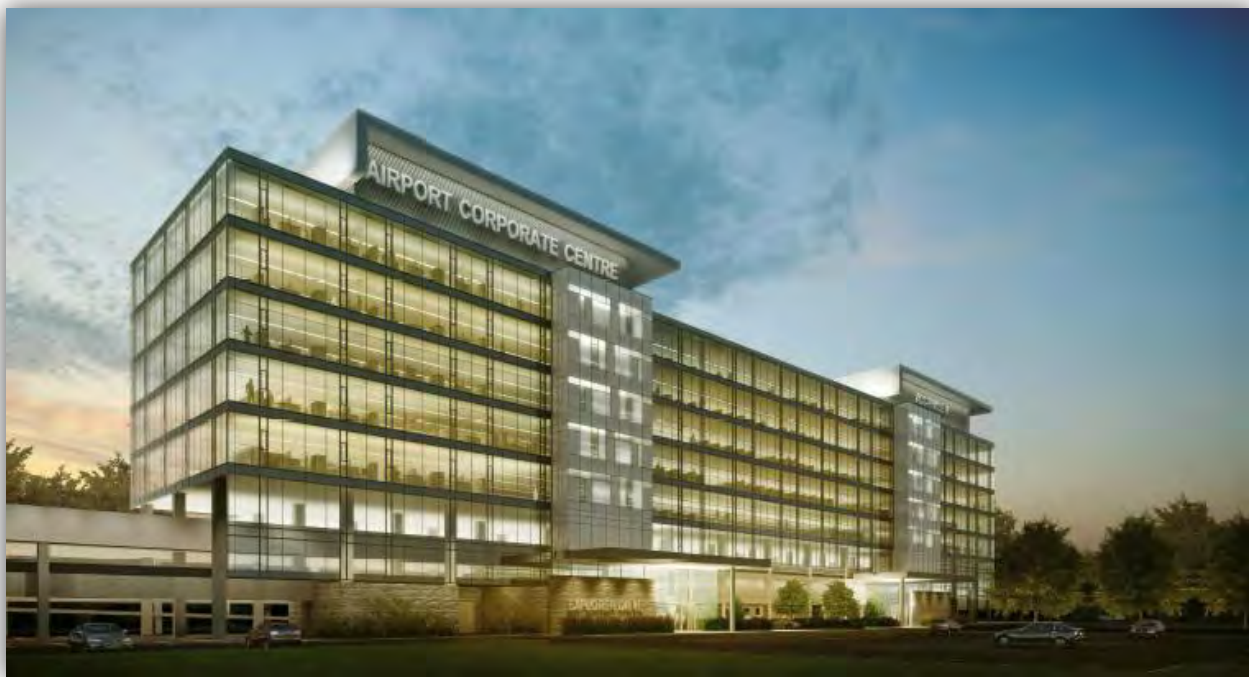
Aerocentre V – Office Complex