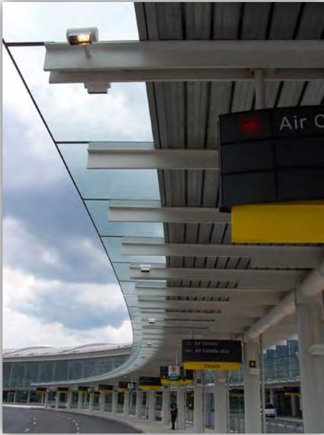
Toronto Int'l Airport – Terminal 3 Toronto ON