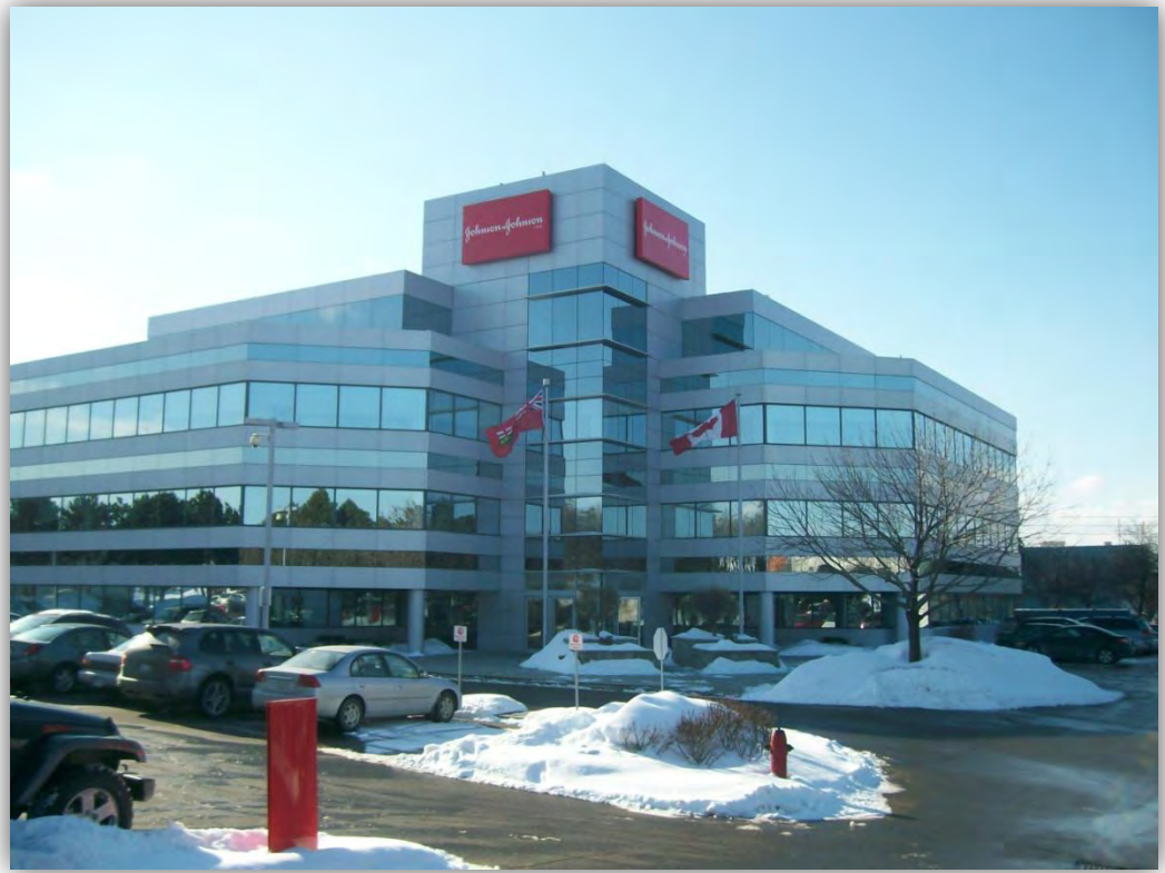
Phizer Pharmaceuticals Office