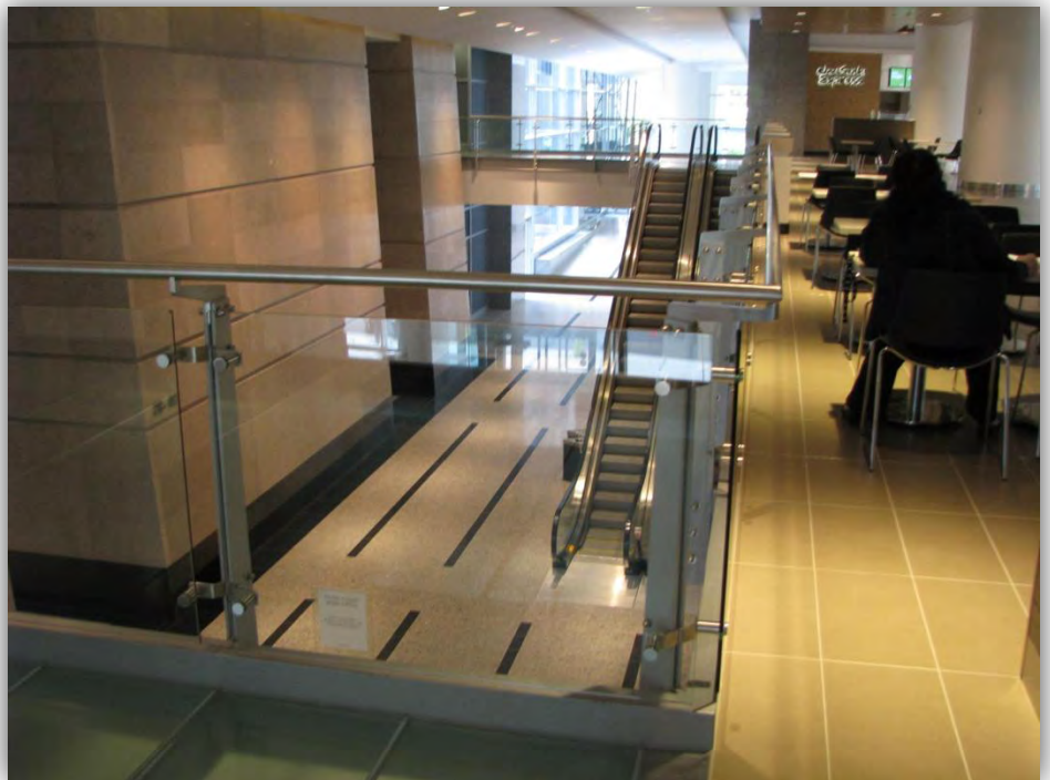
Centennial Place Calgary AB