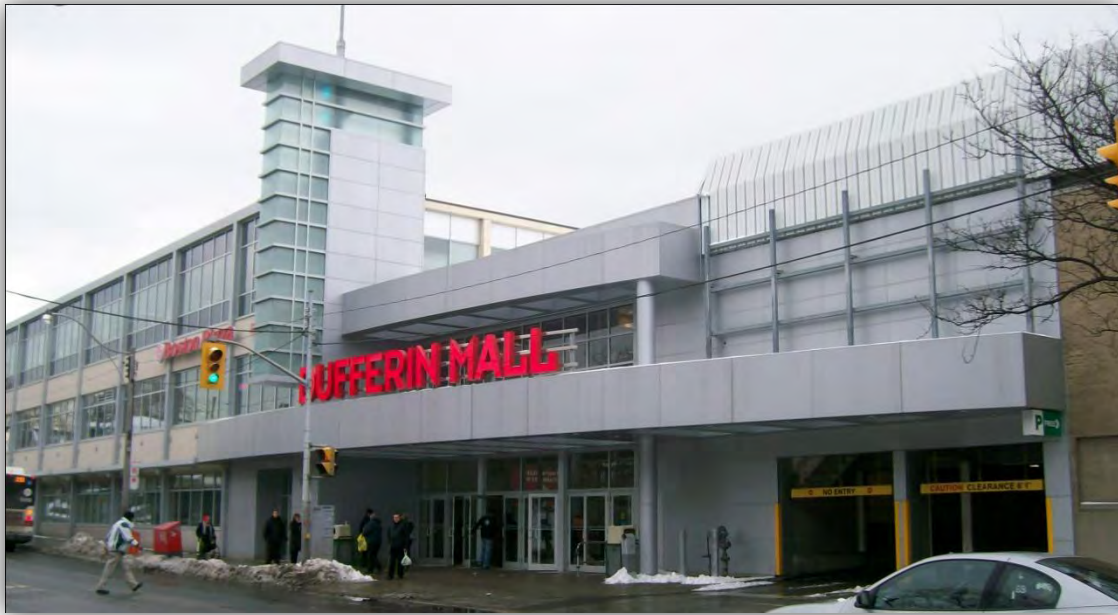
Dufferin Mall Toronto ON