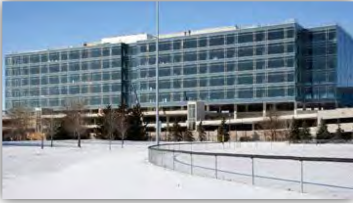
Aerocentre V – Office Complex