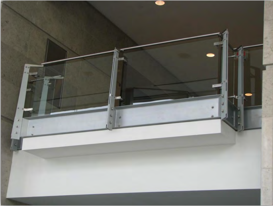
Centennial Place Calgary AB