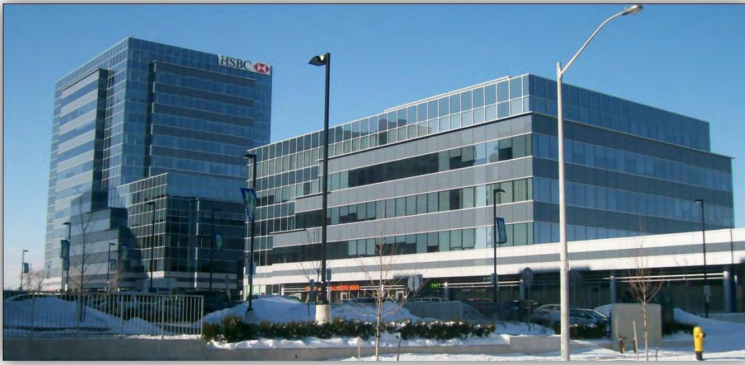
Markham Liberty Office Toronto ON