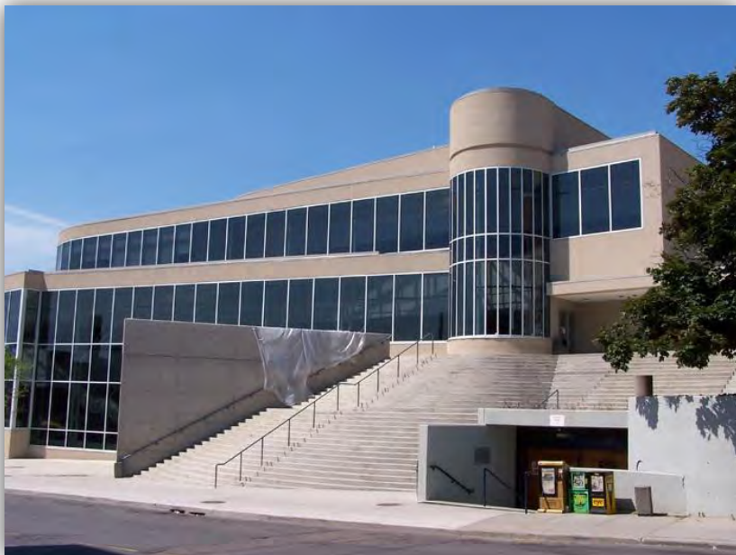
George Brown College Casa Loma Campus Toronto ON