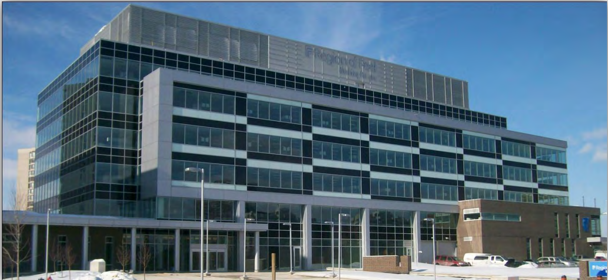
Peel Police Services Brampton ON