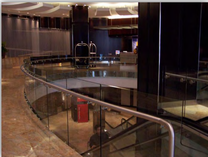
International Hotel Toronto ON